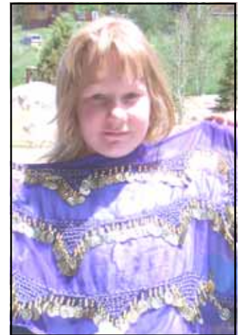
Grandma's Egyptian gifts for cute belly dancers.