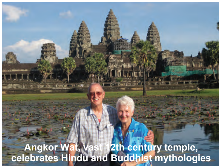
Angkor Wat, vast 12th century temple, celebrates Hindu and Buddhist mythologies