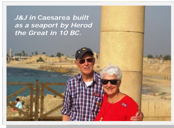
J&J in Caesarea built as a seaport by Herod the Great in 10 BC.