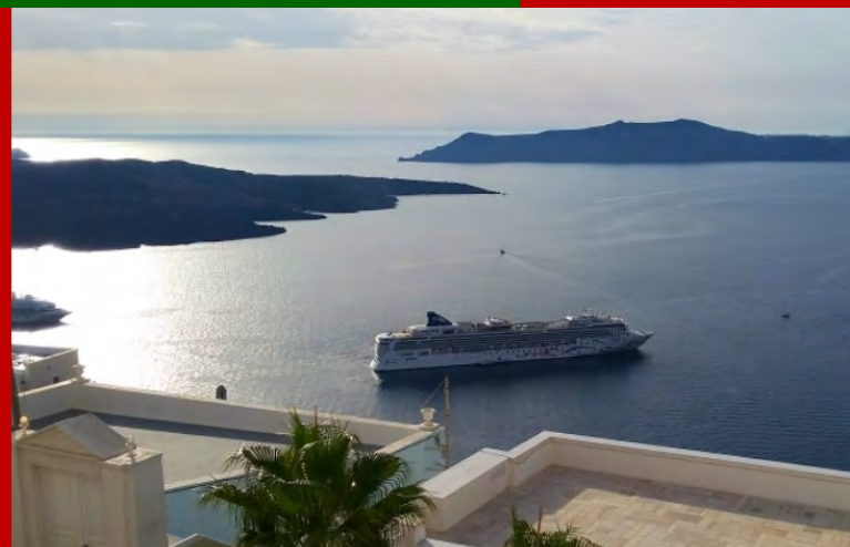
Norwegian "Star" cruises the Greek Isles